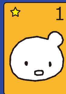
18 Red cards