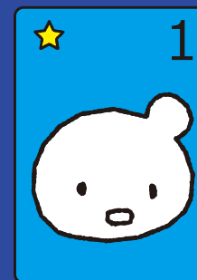
18 Blue cards