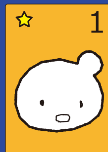
18 orange cards